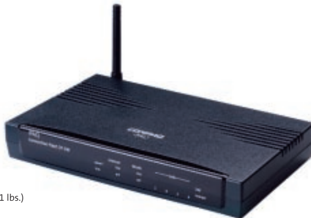
Actual size 4.45" x 2.13" x .21" (1.1 lbs.)

Using the latest technologies, the Compaq iPAQ ™ Connection Point CP-2W Wireless Broadband Gateway makes it easy and affordable to set up a secure broadband network for your home or small office multi-PC environment. The iPAQ Connection Point CP-2W Wireless Broadband Gateway comes cable/DSL-ready and serves both Ethernet and wireless high-speed networks, through which you can share the Internet, files, programs, digital music and more. Having broadband Internet service doesn't have to mean undermined security. The Compaq iPAQ CP-2W Wireless Broadband Gateway packs a powerful combination of security features, like the built-in firewall, wireless encryption, VPN pass-through and more. And whether you're an experienced user or you're just getting started, the iPAQ CP-2W Wireless Broadband Gateway is easily installed and operated – a sure way to simplify your life and connect your world.