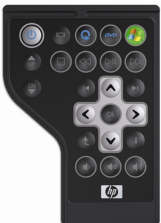
HP Mobile Remote Control