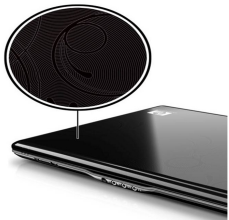
Radiance, the latest HP Imprint finish

HP QuickPlay provides access to DVDs, videos, photos, music, karaoke, streamed or recorded TV 2 - and now games - at the touch of a button. Watch DVD movies on the full screen using simple media controls. Add music to your slide shows or videos with drag-and-drop functionality. Stream, watch live and record TV 2 . Throw an impromptu karaoke party or play preinstalled games from leading brands. Find and stream media from universal plug-and-play devices such as Windows® Media Connect. Listen without disturbing others with included stereo earbud headphones. And control content from up to 10 feet away with the HP Mobile Remote Control that can be stored in the system ExpressCard slot for convenience. It's time to play!