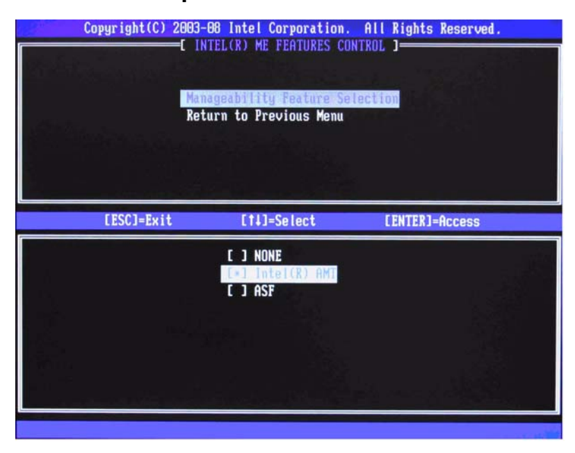
Figure 3 Intel ME Features Control Screen with AMT selected

iii. Select Return to the previous menu.