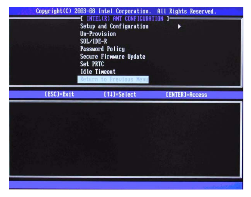
Figure 8 Intel AMT Configuration Screen Continued

13. Select Host Name, and then type a host name Default Setting = HPSystem, Recommended Setting = User Dependent Spaces are not accepted in the host name.