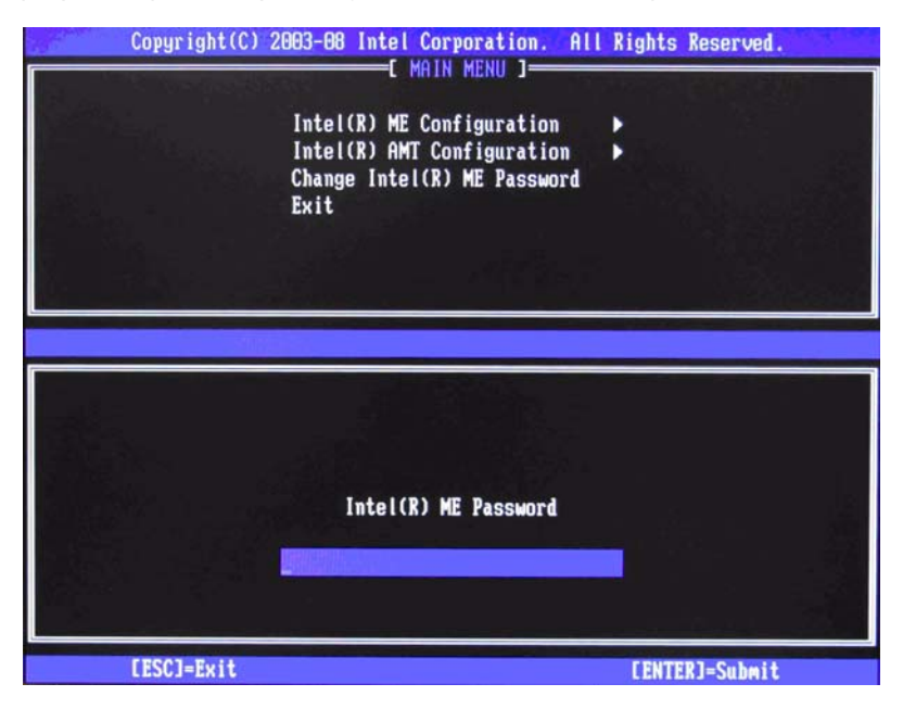
Figure 1 Intel MEBx Password Screen

Press Ctrl+P during POST to enter Manageability Engine BIOS Extension (MEBx) Setup. You can display this option only during POST if set in F10-Setup.