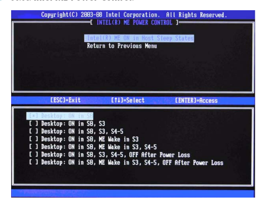
Figure 4 Intel ME Power Control Screen

a. Select Intel ME ON in Host Sleep States, and then select Desktop:ON in S0, S3, ME WoL in S3, S4-5, OFF After Power Loss.