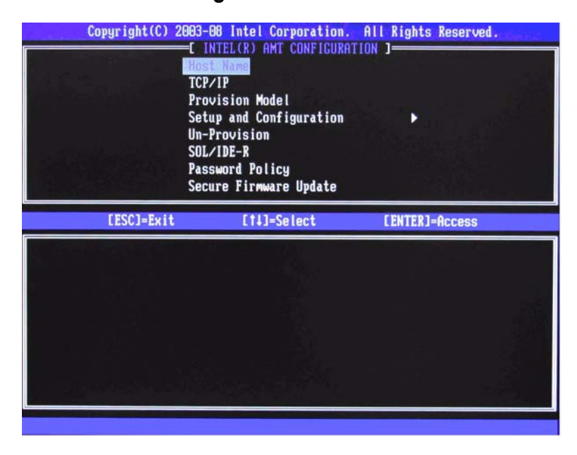
Figure 5 Intel AMT Configuration screen

14. Select Host Name , and then type a host name.