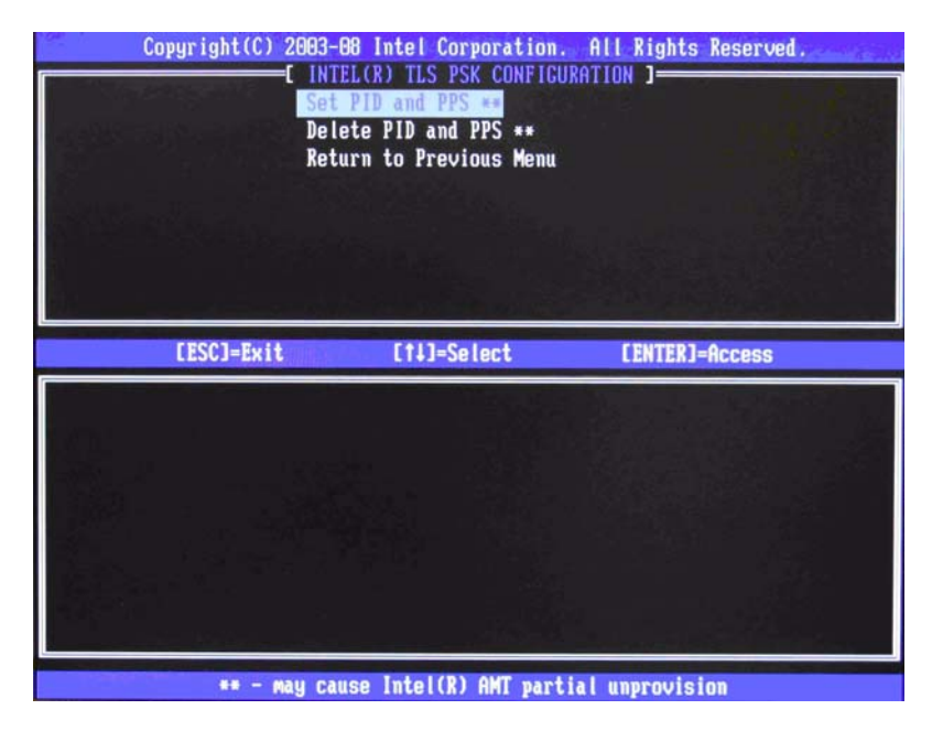
Figure 10 Intel TLS PSK Configuration Screen