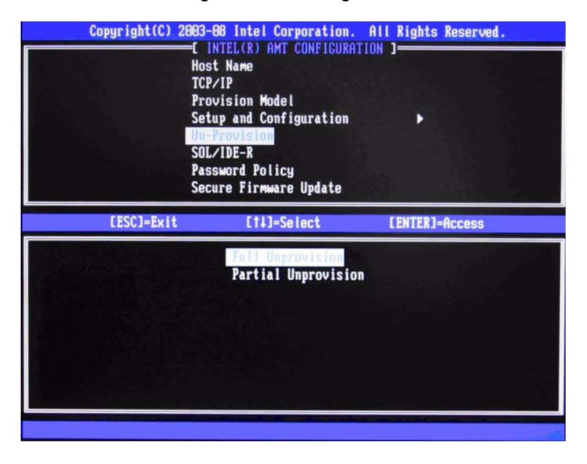
Figure 12 Intel AMT Unprovisioning Screen

Return to Default is also know as Unprovisioning. An AMT Setup and Configured system can be unprovisioned. It is done through the AMT Configuration Screen and the Un-Provision option.