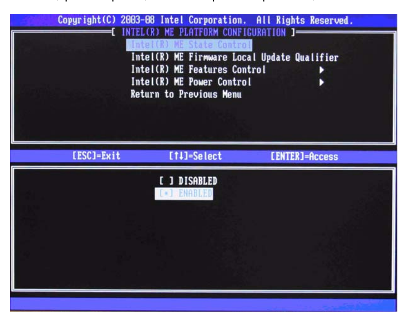
Figure 2 Intel ME Platform Configuration screen

5. Select Y . ME platform configuration allows IT personnel to configure ME features such as AMT/ASF selection, power options, firmware update capabilities, and so on.