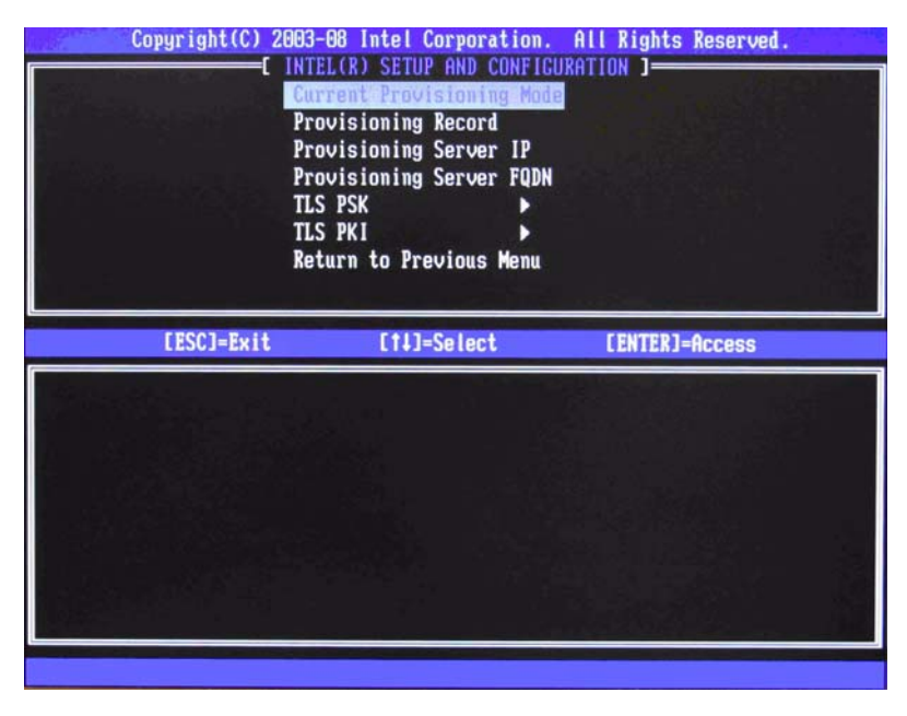
Figure 9 Intel Setup and Configuration Screen

This is the menu where the Enterprise mode provisioning data is entered.