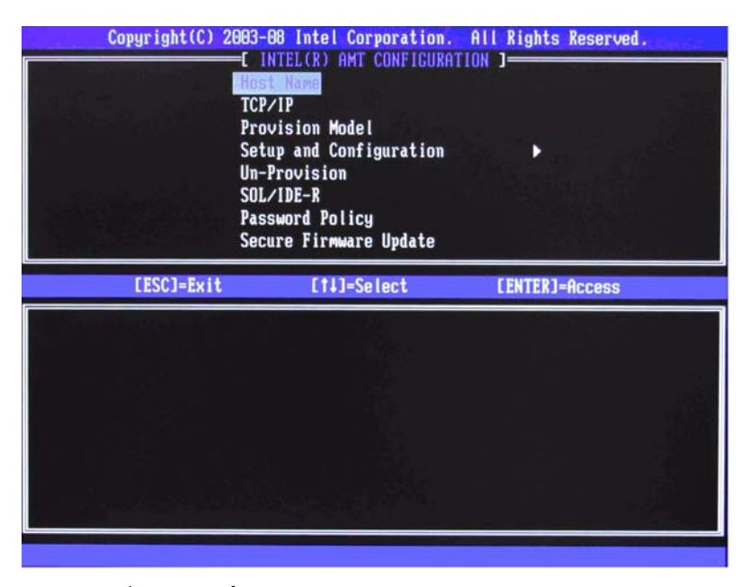
Figure 7 Intel AMT Configuration Screen

12. Select Intel AMT Configuration . The Intel AMT Configuration screen includes numerous options, which are available by scrolling down the menu.