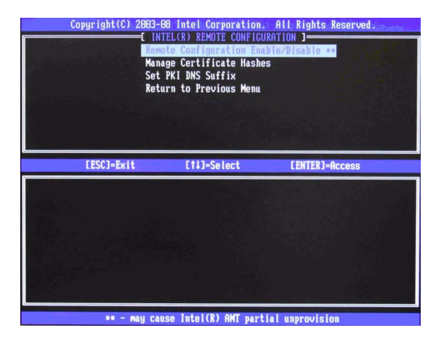
Figure 11 Intel Remote Configuration Screen