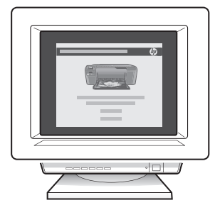
Animations will guide you through the printer setup during the software installation.

Insert the software CD to start the software installation. For computers without a CD/DVD drive, please go to <a href="https://www.hp.com/support">www.hp.com/support</a> to download and install the software.