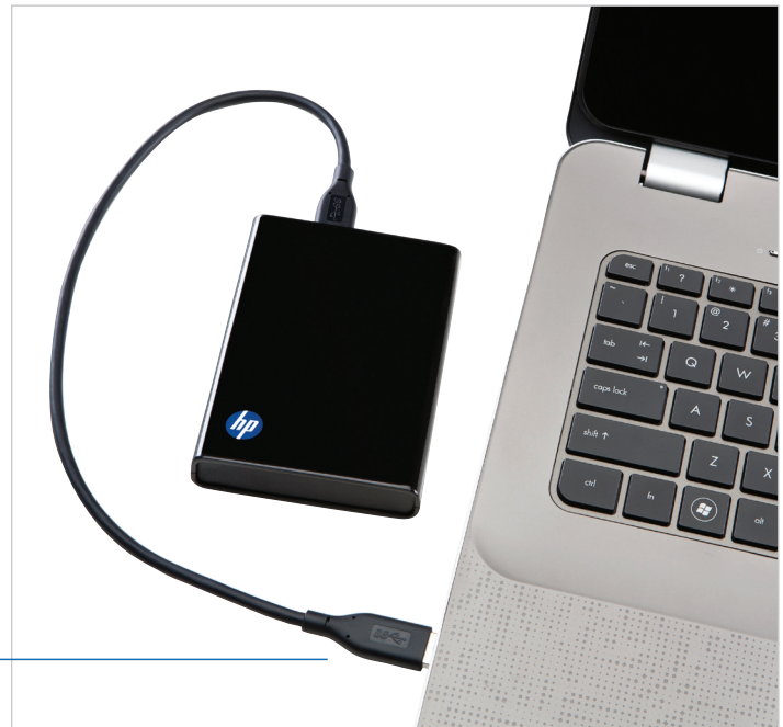
USB 2.0 and USB 3.0 Interface

Questions about the HP Portable Hard Drive? Look us up online at http://www.hp.com