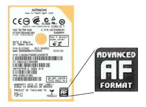
Figure 1. HDD label featuring the Advanced Format logo