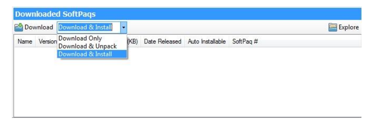
Figure A-3. Downloaded SoftPags window

Select the appropriate download option based on the following: