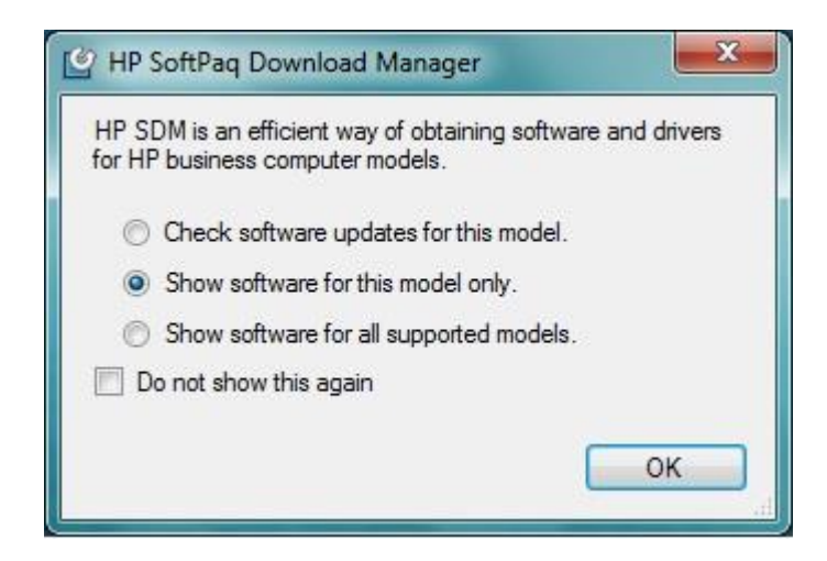
Figure A-1. SoftPaq Download Manager menu

The current platform is automatically be displayed and selected in the Product Catalog window.