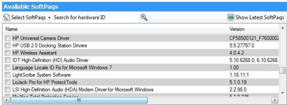
Figure A-2. Available SoftPaqs list