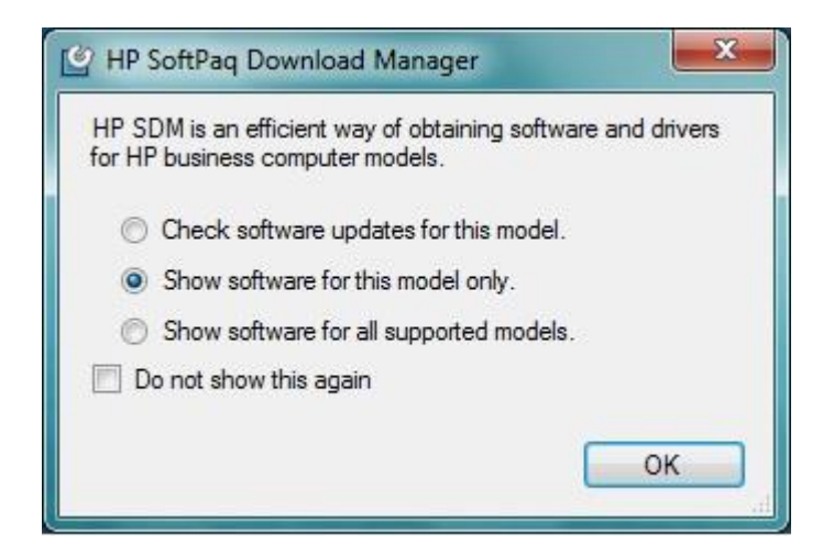
Figure A-1. SoftPaq Download Manager menu

The current platform is automatically be displayed and selected in the Product Catalog window.