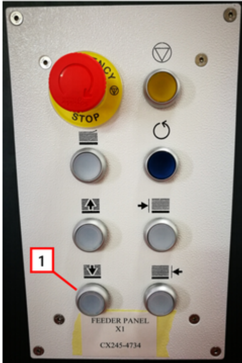
1 Lower lift button