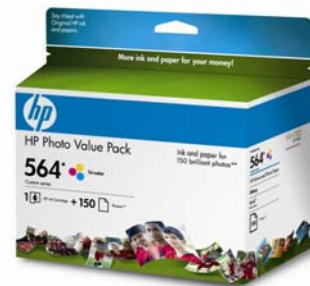
564 photo value pack