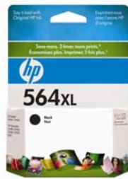
564 high-capacity XL cartridges