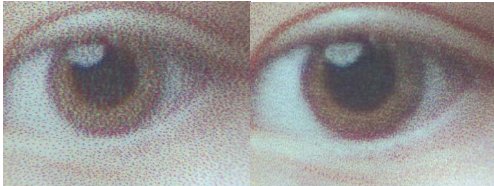
Micrograph of single-drop-volume image

HP's new dual-drop-volume cartridge technology eliminates the need for lighter, photo dye-load inks, reducing image grain and increasing the available color gamut for photos. With HP dual-drop-volume cartridge technology, customers can get photo quality comparable to six-color inkjet printers with a five ink printing system. Dual-drop-volume printing offers customers exceptional versatility by allowing the printer to produce light color shades and rich photographic black essential for lab-quality photos and vibrant color for graphics—all from a single set of ink supplies. In dual-drop-volume modes, the printer can eject color and photo black ink droplets as small as 1.3 pl and as large as 5.2 pl. About 3.8 billion of these 1.3 picoliter droplets would fit in a teaspoon. The printer can fire any combination of these small or large ink droplets on a given print position—small and large droplets together, just small drops or just large. The size and combinations of ink droplets are determined by the printer in order to provide the optimum print quality and speed. Dual-drop-volume printing is used when printing photos and color graphics in Normal, Best and Maximum-dpi print modes on select HP photo and brochure papers. 2