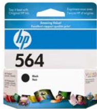
564 standard cartridges

Customers will enjoy affordable printing with low-cost, individual ink cartridges, letting them replace each ink cartridge separately when it's needed. For fewer cartridge changes and a better value for frequent printing, customers can choose high-capacity Original HP ink cartridges that offer three times more black printed pages and 2.5 times more color printed pages than standard Original HP ink cartridges. For more information about HP ink cartridges and page yields, please visit: www.hp.com/go/learnaboutsupplies . HP 564 Photo Value Packs, which include all the ink and photo paper customers need to print 150 lab-quality photos at home, offer a convenient, affordable photo-printing solution. 5